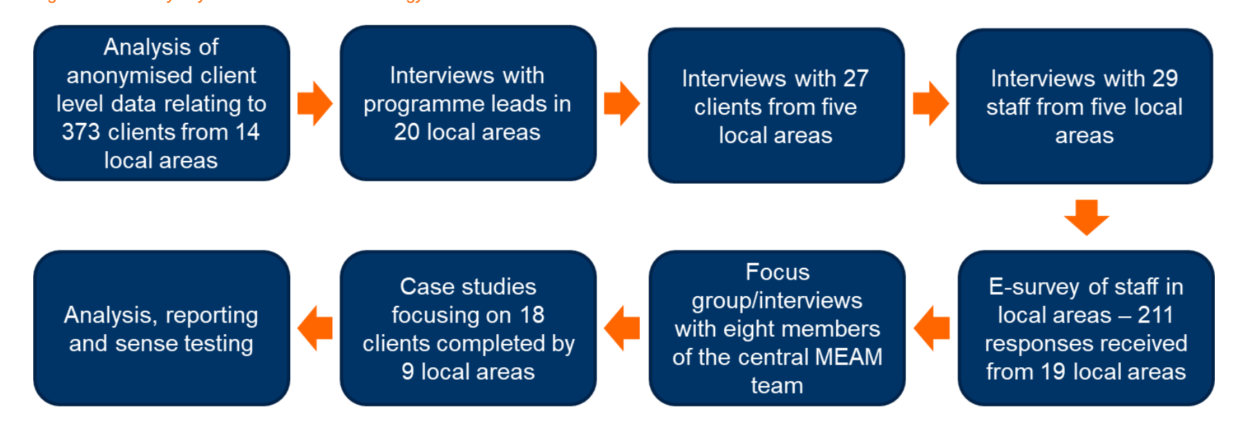
Figure 4: Summary of year 2 evaluation methodology