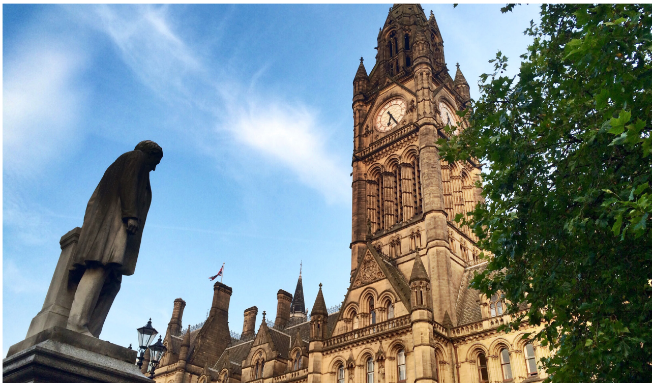
Manchester Town Hall. Greater Manchester has led the devolution agenda in England, and has recently secured new powers over the health, care and criminal justice systems.

The devolution agenda in England was driven to a great extent by the former Chancellor of the Exchequer George Osborne, and his departure from office in July 2016 leaves its future less certain. However, the issue of greater power for local areas has risen to such prominence that it is likely to remain on the agenda. Theresa May has appointed Andrew Percy MP as Minister for the Northern Powerhouse and kept Lord Jim O’Neill (a prominent advocate of devolution) in place as Commercial Secretary to the Treasury, signalling continuity with the previous administration.