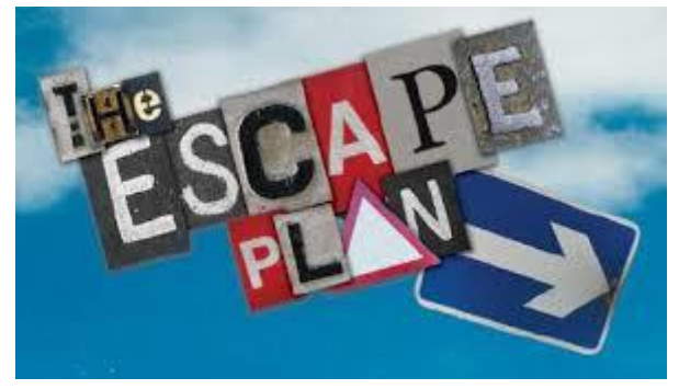
Groundswells research on leaving homelessness <a href="http://bit.ly/1eX5QgM">http://bit.ly/1eX5QgM</a>